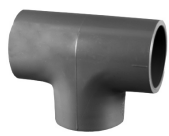
Part No. PVC 8400 Tee [SxSxS]